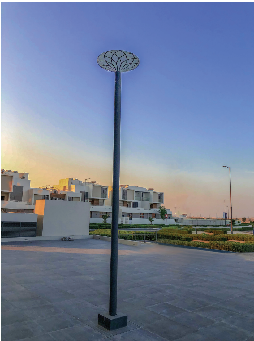
Project: Dubai South, U.A.E