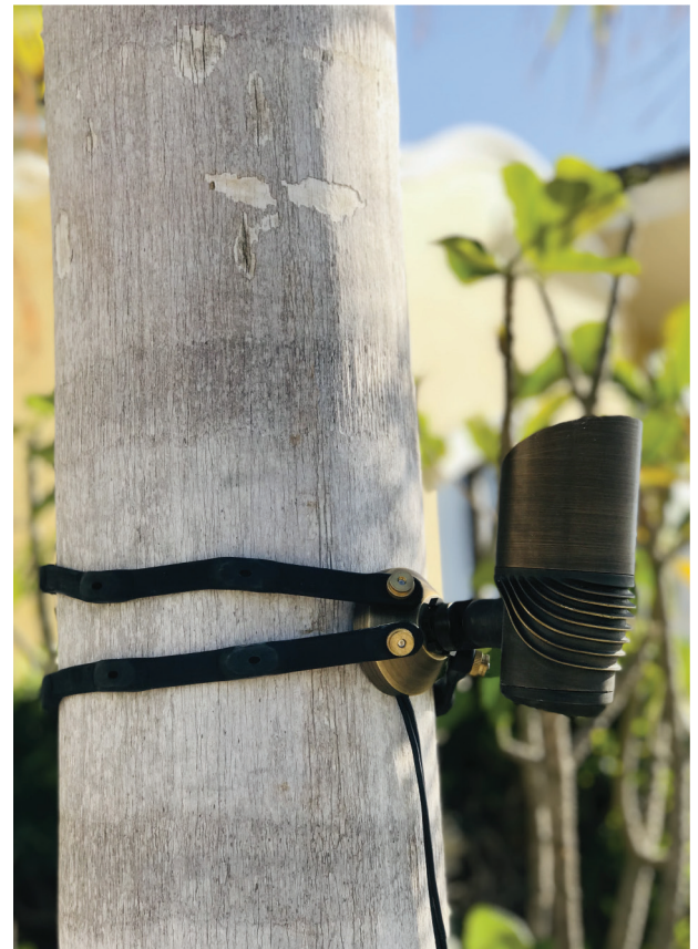
Project Name: Palm Dubai, UAE