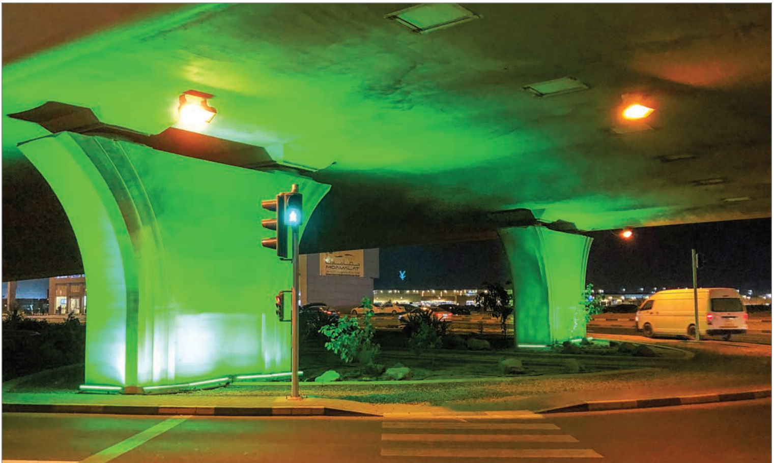
Project Name: Overpass Bridge Lighting , Ajman , UAE