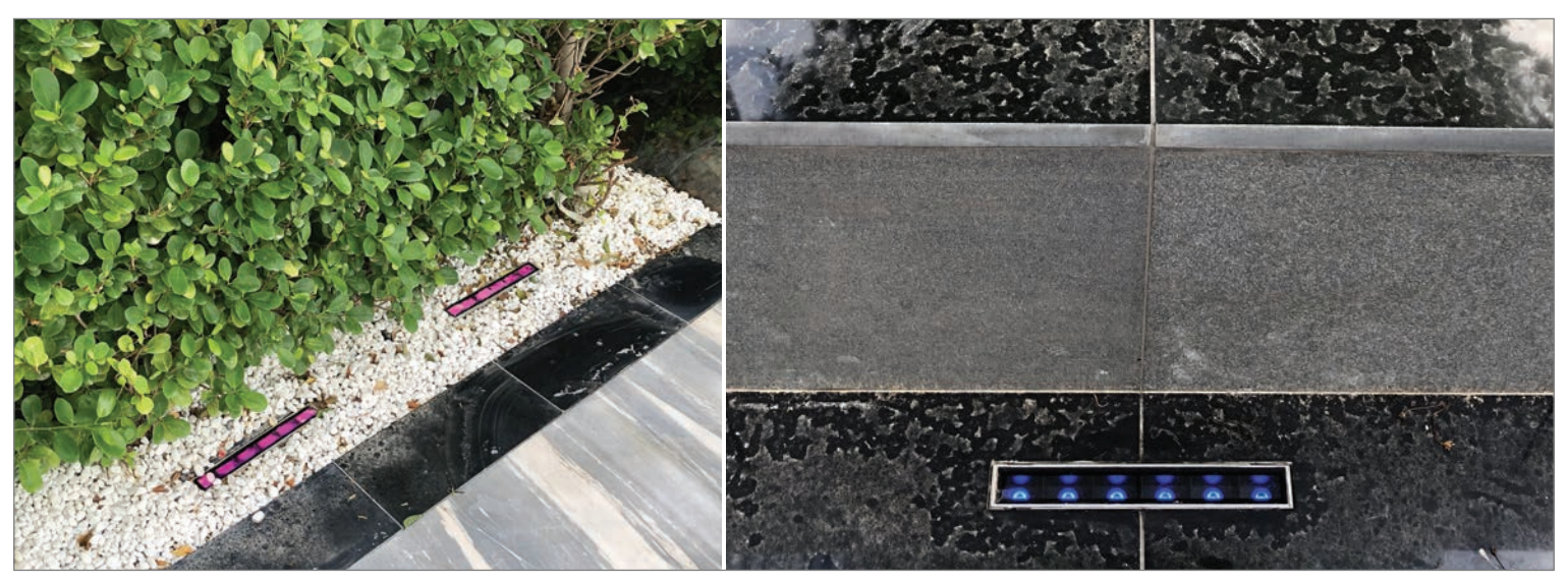
Project Name: Emirates hills , Dubai , UAE