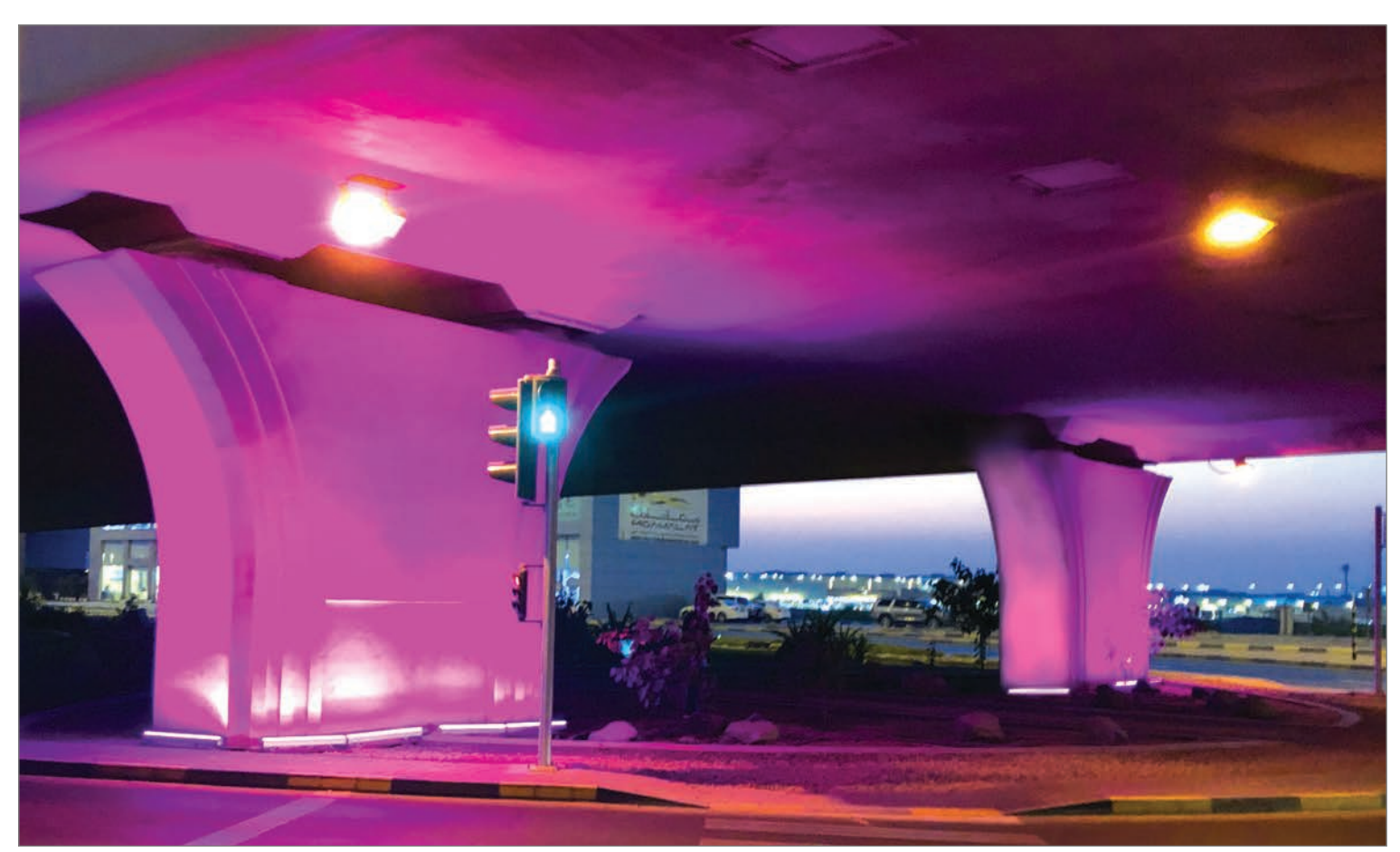
Project Name: Overpass Bridge Lighting , Ajman , UAE