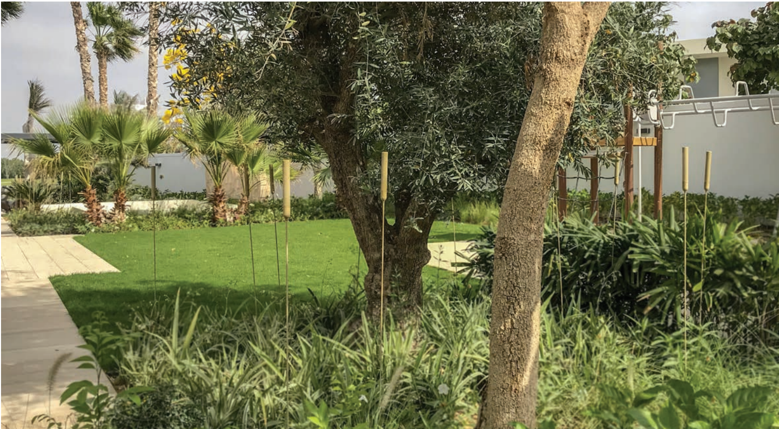
Project Name: Serenity Show Villa - Tilal Al Ghaf, Dubai, UAE