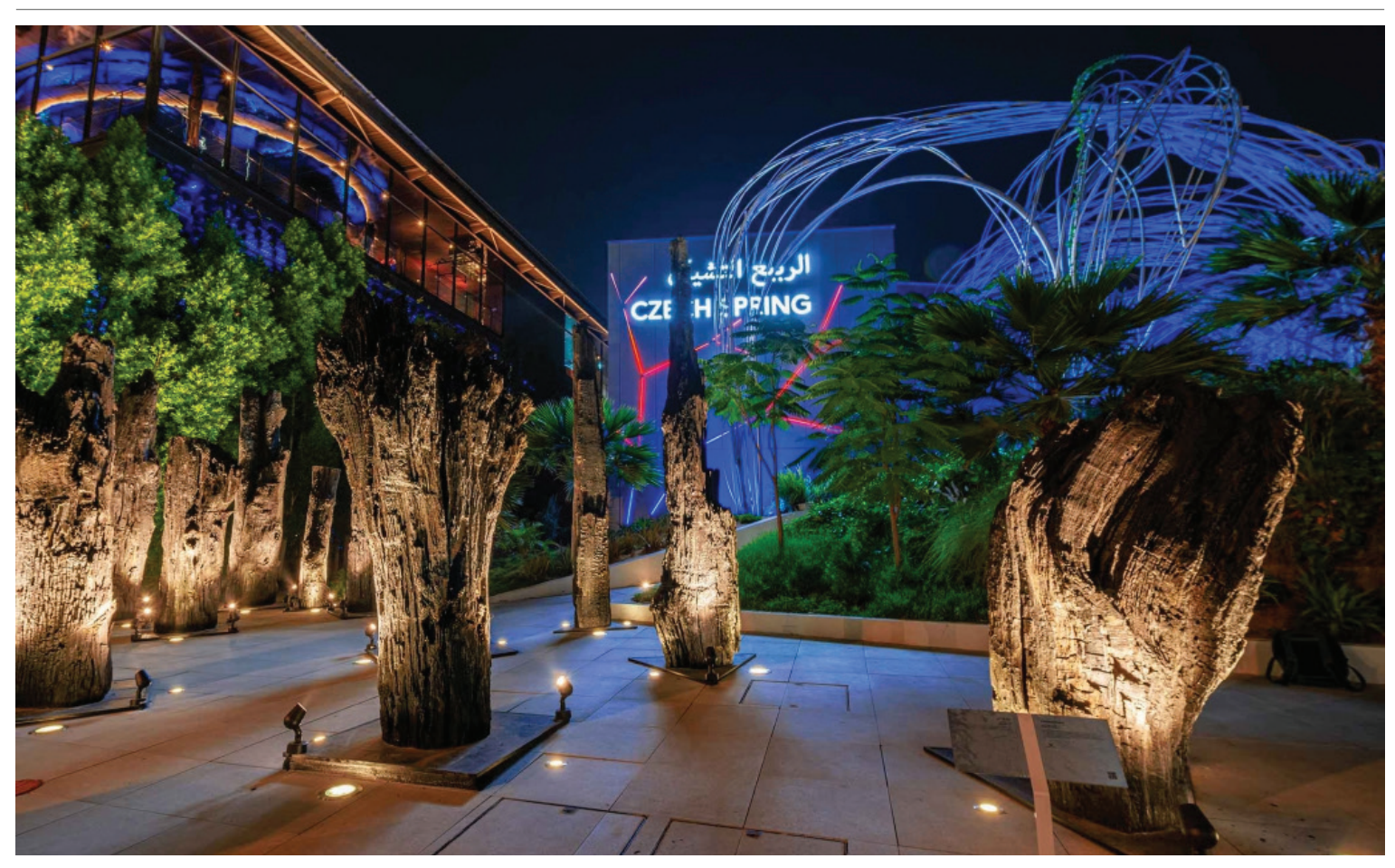
Project Name: Czech Republic at Expo2020, Dubai, UAE.